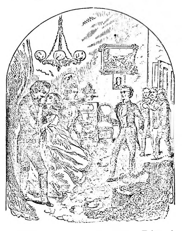
lady, closely vailed, and a little boy. Taken altogether, it was a curious and strange scene. The parties looked at each other in silent astonishment, as if asking what all this meant. The stranger, 6^*

when a new spectacle arrested them. The door had been quietly opened, and a gentleman, habited in a suit entirely black, entered the room, conducting a